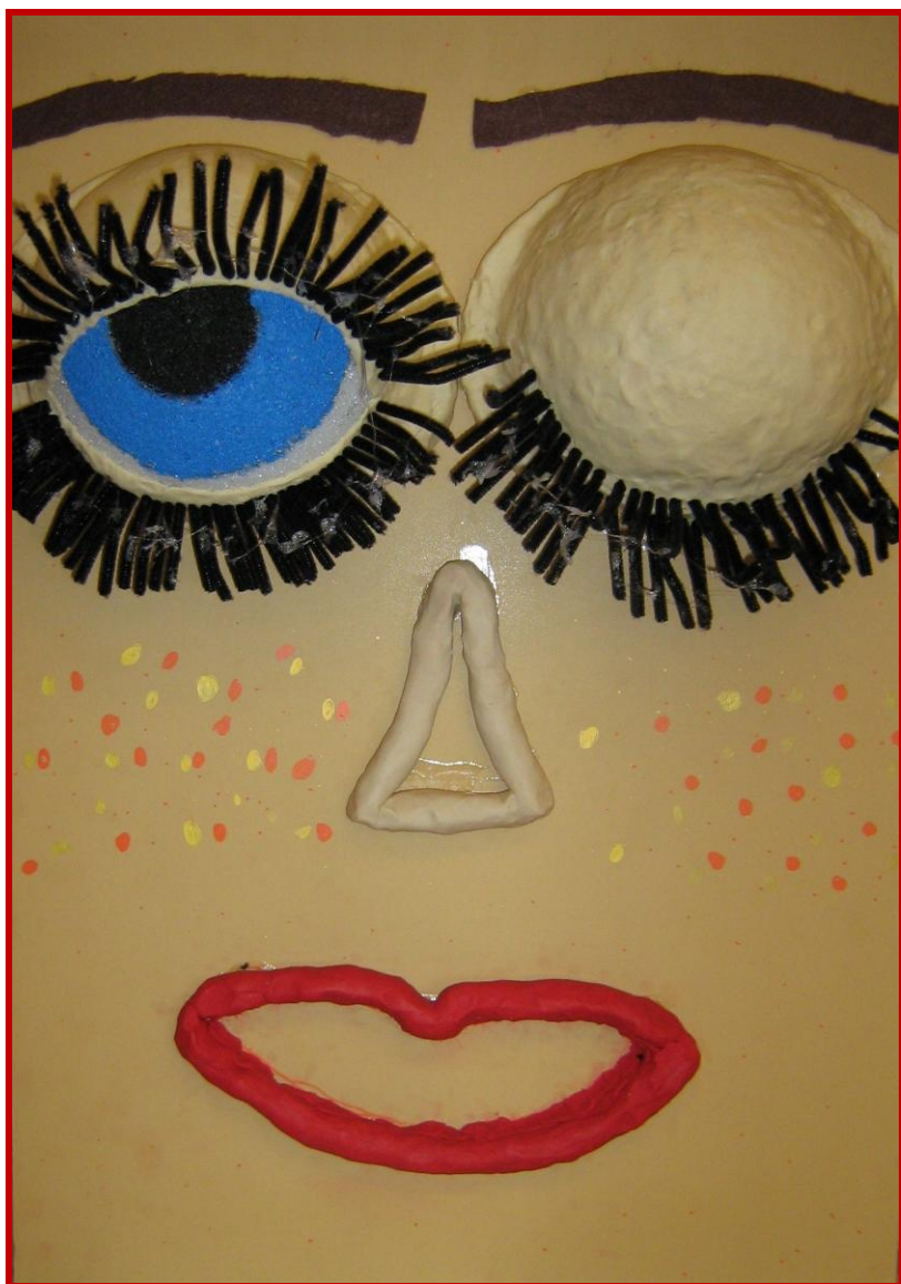
Away Laughing on a Fast Camel