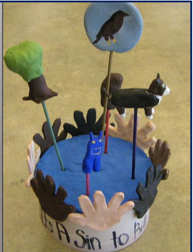
To Kill A Mockingbird

The tree symbolizes community. The tree was a place where they hung people. Now they have transformed it into the center of a play ground. The tree went from being a symbol of death and injustice to now having the fun playful aspect of a playground. This shows a good community leaving the past behind and bringing in the new.