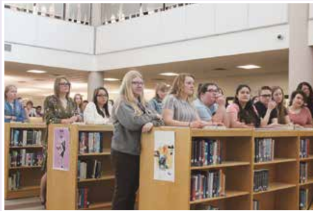
Students prepare for Legacy Books ceremony.