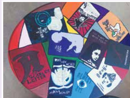
Library table top finished with original art design.