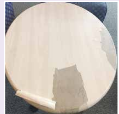
Peeling laminate on LHS Library table top before renovation project.