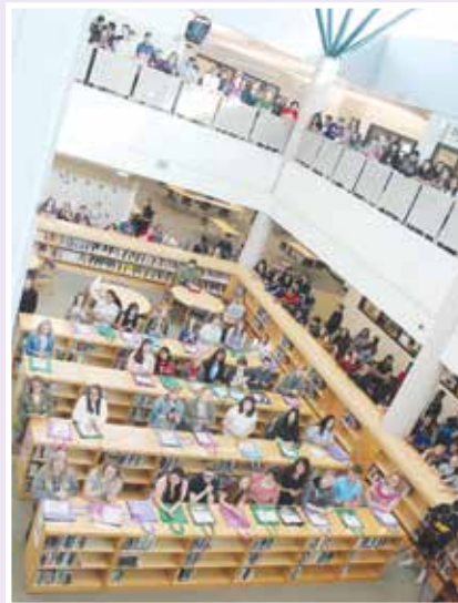
Legacy Books Project Ceremony is viewed by students on 1st and 2nd floors.