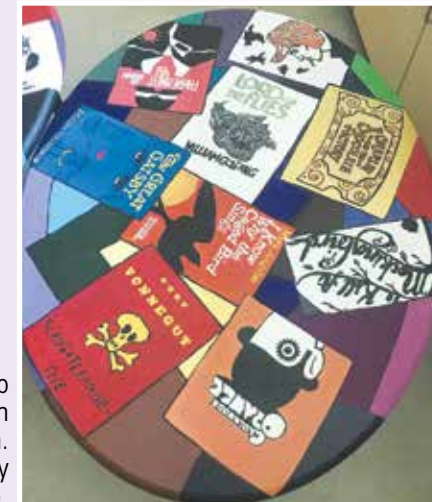
Library table top finished with original art design.